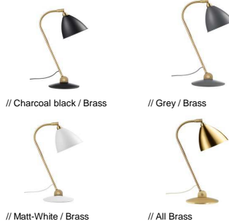
// Charcoal black / Brass