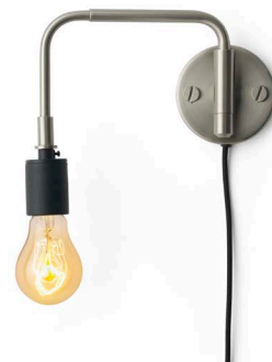
Brushed Steel 1960039